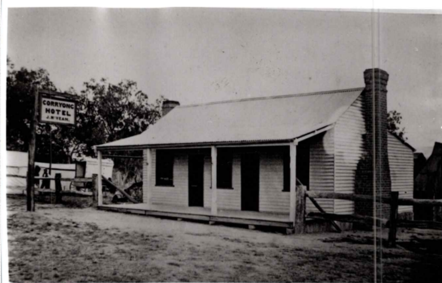
"Corryong Hotel" 1875.

Corryong was named after the Kuriong pastoral run, taken up in 1839 by a pastoralist from New South Wales. It is thought that the name was derived from Aboriginal expressions referring to red body painting clay or a possum skin garment. The Corryong Hotel was established in 1875. The first building built in Corryong. J.A McVean built the weatherboard hotel on it's current site and ran it till 1889. The chimney in the photo is still present today.